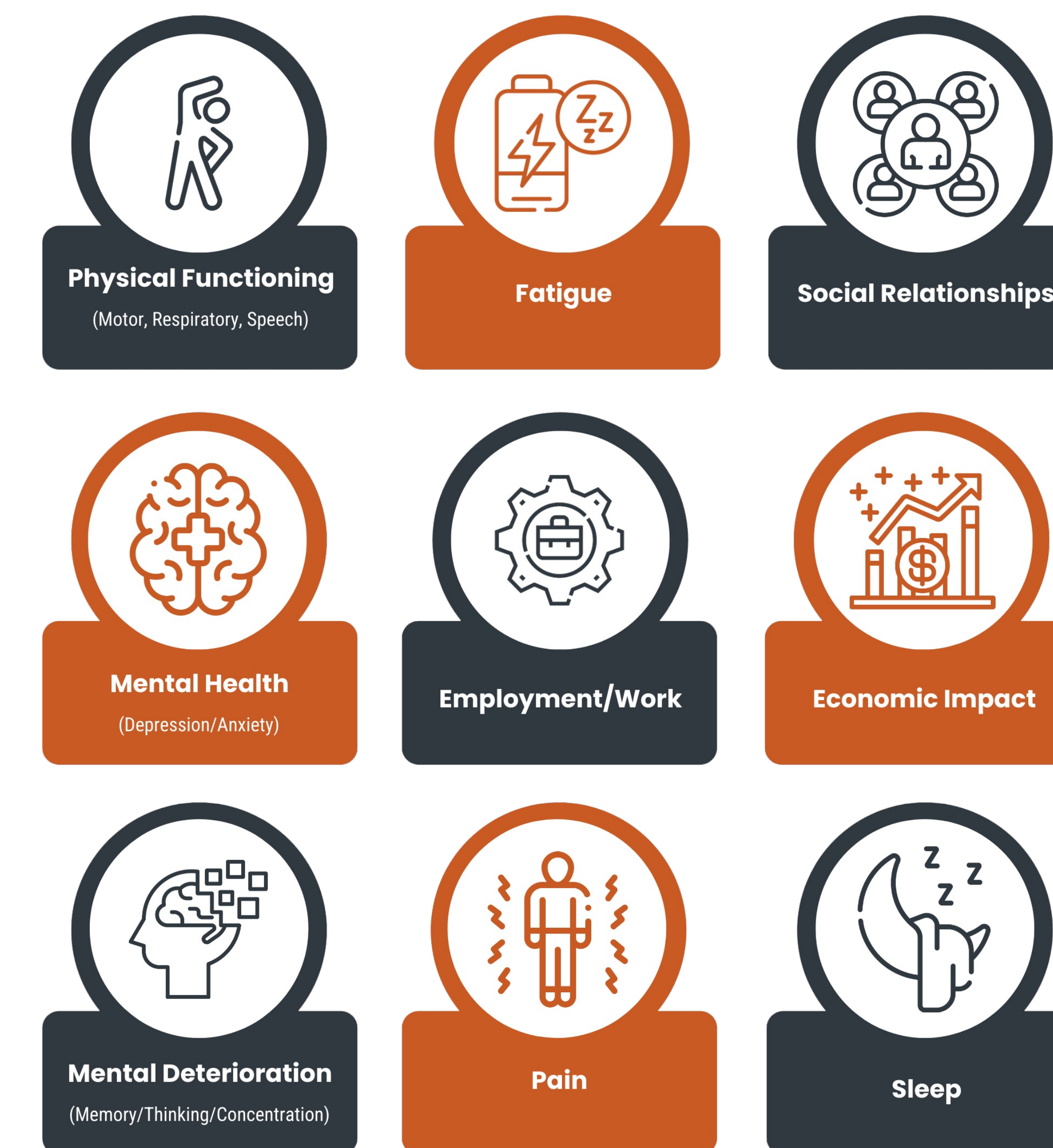
Figure 2. Common Outcomes Across ≥Five of Eleven Rare Diseases