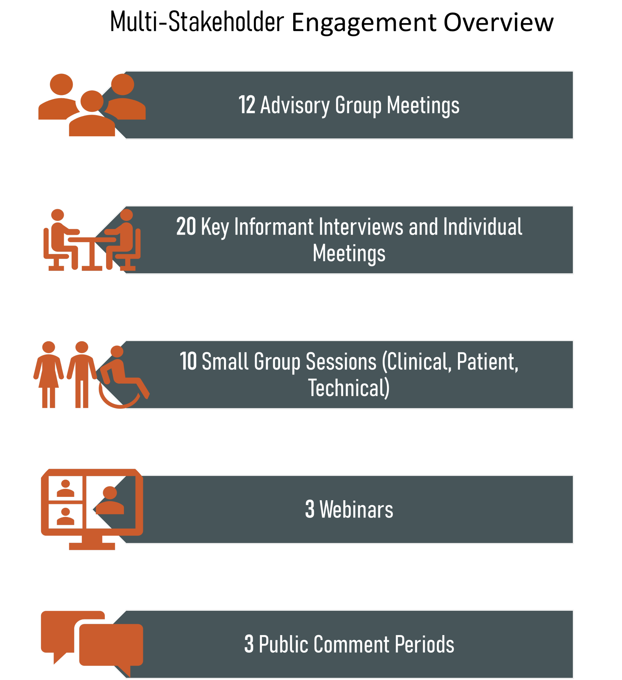
Figure 2. IVI's process for multi-stakeholder engagement during the 3-year MDD model development process